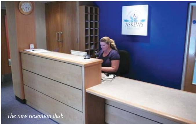
The new reception desk