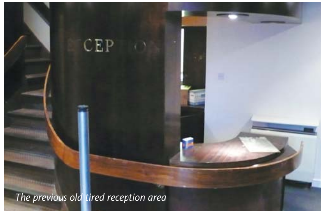
The previous old tired reception area